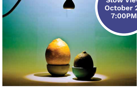
Blair C. Tate, Lemon and Lime , 2013, fluorescent and tungsten light chromogenic print