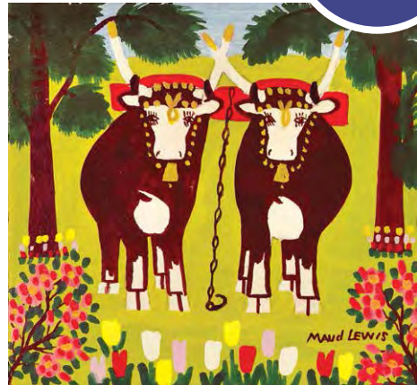
Maud Lewis, Untitled , c. 1966, oil on board

An exhibition dedicated to the particular niche of the gallery's permanent collection which features art that is appreciated for its extreme individuality and inventiveness.