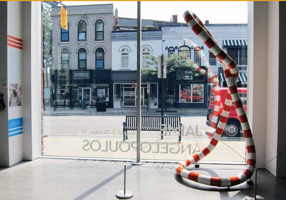
Jaime Angelopoulos, Rise Up , 2014, installation view