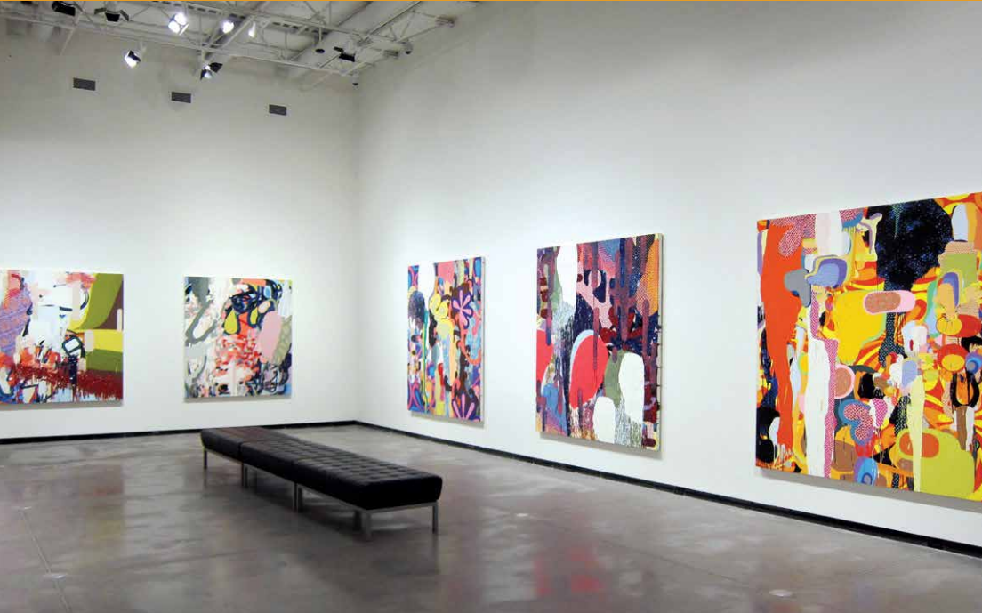
Installation view of John Kissick The Boom Bits