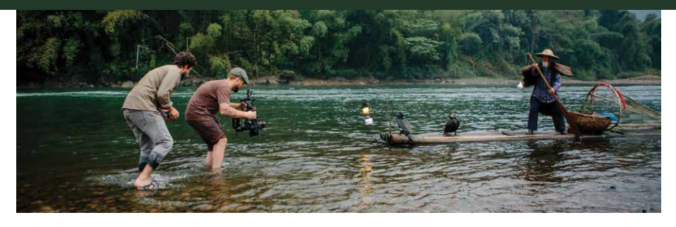
The Legacy Project with Foster Visuals