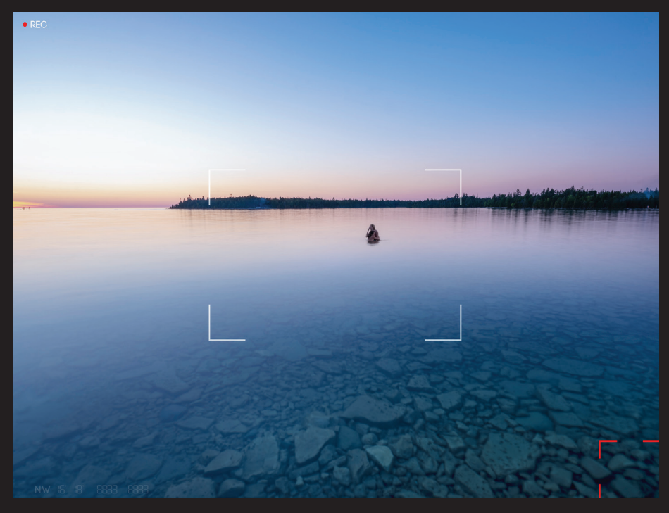
Susan Dobson, Fading Light, 2020, photograph