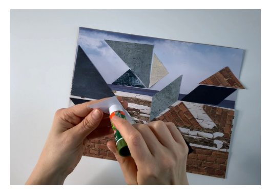
Step 2 - Arrange shapes on your background

Use the textured tangram shapes and arrange them on your background. Be playful and explore different compositions.